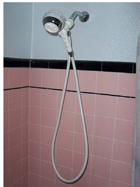
Figure 5. Flexible shower head.

I have successfully used this method without any kind of