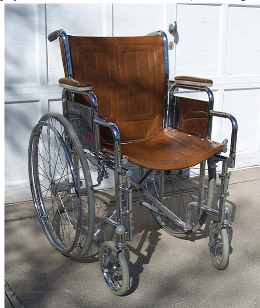
Figure 2. Primary wheelchair

Some wheelchairs have meal tray accessory that you can buy that snaps onto the wheelchair handles for someone who cannot sit at a table. Since my wheelchair was second-hand, no tray was available. I made a simple food tray out of 1/4" Masonite. I used Velcro strips stapled to the Masonite to secure it to the wheelchair handles on each side. To keep the tray from slipping forward, I drilled a small hole in the back on each side and then used a small string threaded