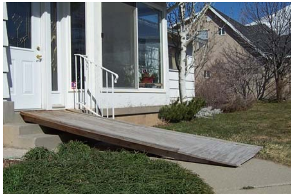
Figure 1. Ramp

In our case, a friend who was physical therapist living nearby helped me obtain two 10 foot 2"x4"s (rails) and a surface sheet of 3/4" plywood, 4 foot x 8 foot. We cut the sheet to