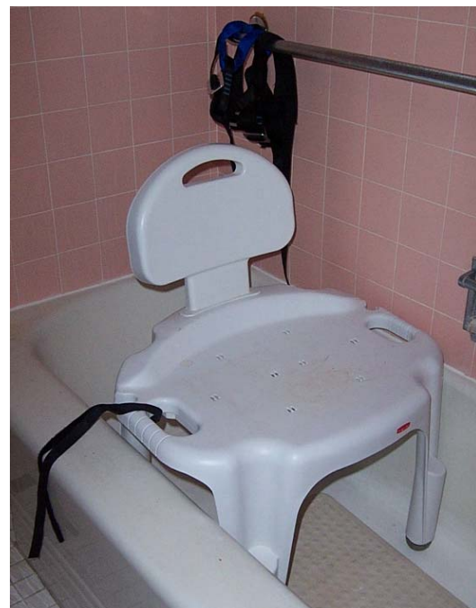
Figure 3. Bathing char with Velcro strap. The climbing harness used for transfer is on the grab bar in back.

I assure you that bathing will be one of the most challenging events in home care. And first, I will tell of a short episode that was a terrible experience. After my wife left the care facility, an outpatient nurse and therapist came to our home to help with the daily chores, one of which was bathing. The therapist showed us how to bathe my wife early in the transition period. With my wife in the smallest wheelchair, she was pushed into the bathroom